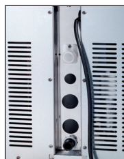
Recessed Connections Panel